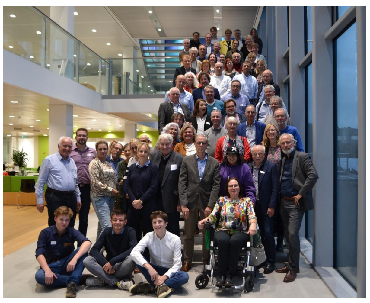
All participants of the exchange in the town hall