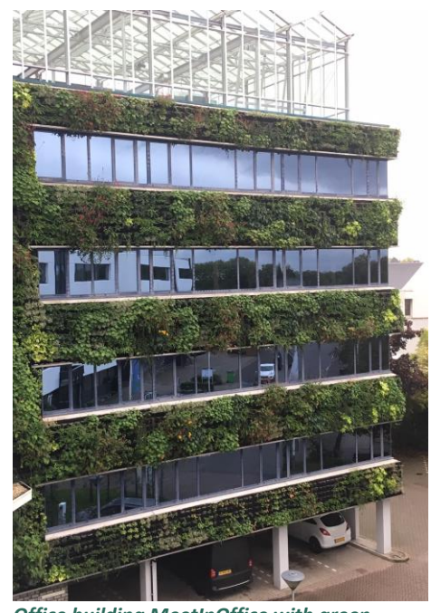
Office building MeetInOffice with green facade

Finally, the dinner was accompanied by a photo review of the day. There was also a short presentation by Sandra Oosterhout about a sustainability project in Nambia, which is implemented with the participation of the Woerden Citizens' Committee. Finally the warm farewell by both mayors followed and the Steinhagen delegation travelled back inspired. The return visit of the delegation from Woerden to Steinhagen is already planned.