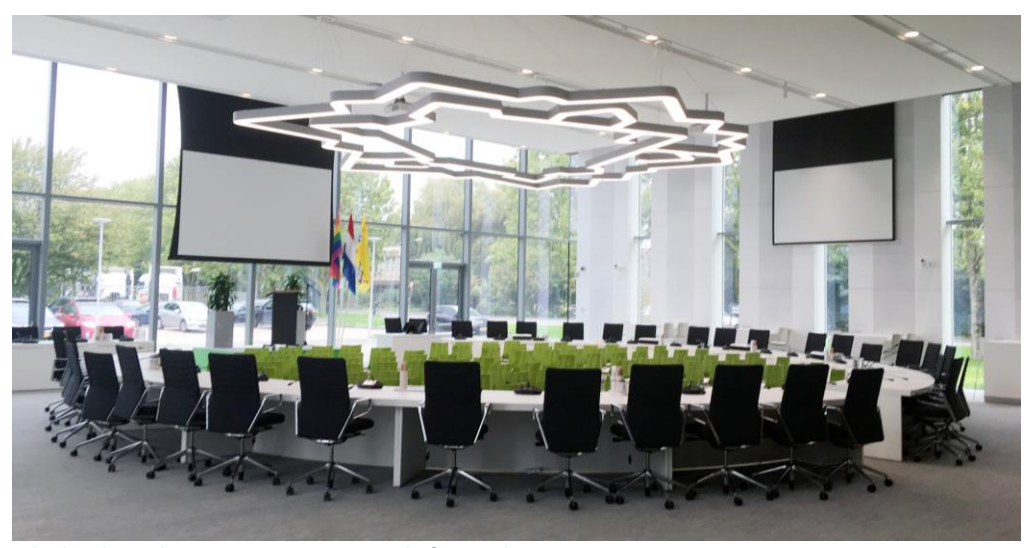
The bright and transparent city counsel of Woerden

Woerden, emphasised that it was not easy to reach all citizens and stakeholders with the municipality's energy transition-activities and that it was important to make climate protection feasible and financially viable for everyone. In the subsequent presentation on mobility, it was pointed out that Woerden has already set up 200 electric charging stations. For comparison: Steinhagen has only two so far. Woerden is working on making traffic in the area more climate friendly. It tries to achieve that via community-supported car sharing and a bicycle expressway from Woerden to Utrecht. A kind of pilot project in Woerden is the neighbourhood battery, which serves as a flexible buffer and storage for the local power grid. An important finding of the project is that piloting new energy system transformation activities should always take place in consultation with all relevant stakeholders. This