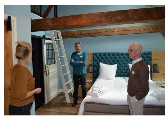
Group 3 at the Stadshotel van Rossum

The second excursion group visited the Kreuger pig breeding farm, which deals intensively with the balance between a financially healthy farm, animal welfare and the environment. For example, waste products are used as animal feed and emissions are reduced by the use of an air purifier. The next stop was the Groenendijk company, which manufactures company clothing from easily recyclable textiles. The factory building was also built from recyclable materials.