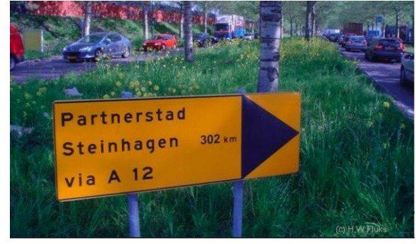
Street sign in Woerden

A film<sup>1</sup> about the importance of local climate measures and the activities of the Woerden community