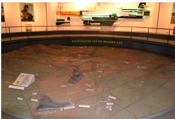
West Macedonia Lignite Center

Furthermore, work is currently being carried out on a control instrument for the coordination of small hydroelectric power plants, the construction of pumped storage power plants and net metering models, and there is also a geothermal PV project for the energy supply of a school. The municipality itself operates three electric cars for its employees and participates in other circular economy projects (SYMBI-INTERREG EUROPE) and energy transformation projects, such as the Stardust network. In this network, seven European municipalities exchange information on digital solutions for sustainable development and sustainable energy supply.