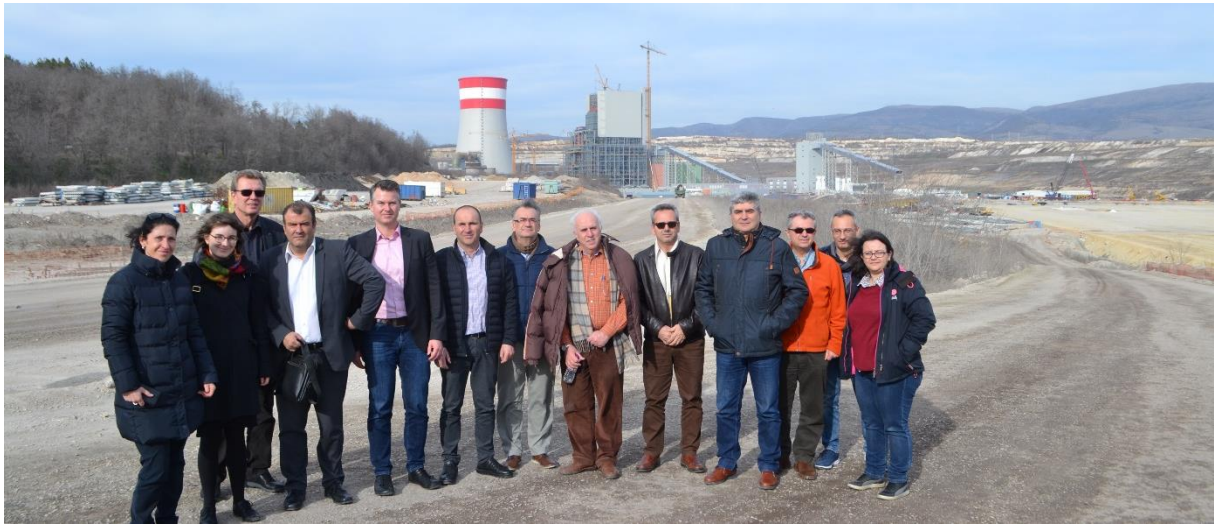
Representatives of Braunbedra und Kozani in Ptolemaida

Furthermore, work is currently being carried out on a control instrument for the coordination of small hydroelectric power plants, the construction of pumped storage power plants and net metering models.